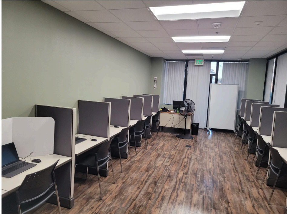
Computer Lab 2