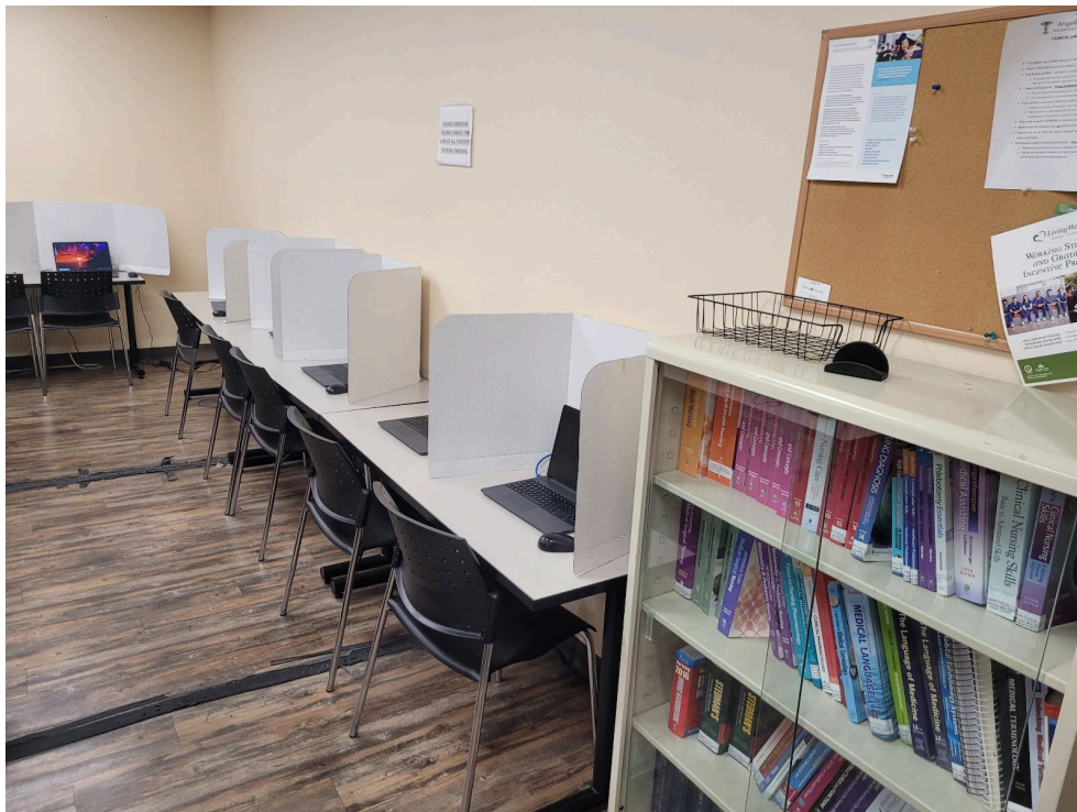
Library with computer access or digital library