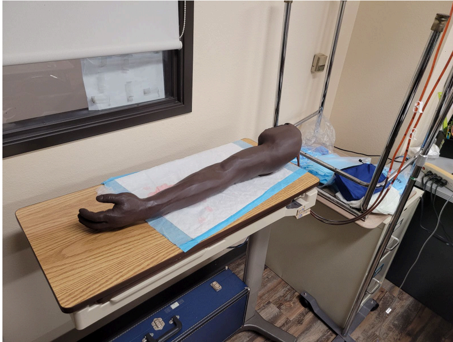
IV Arm task trainer