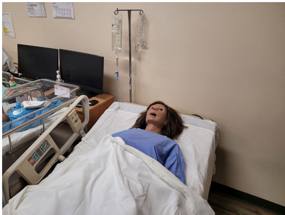
Sims Lab Noelle with Newborn