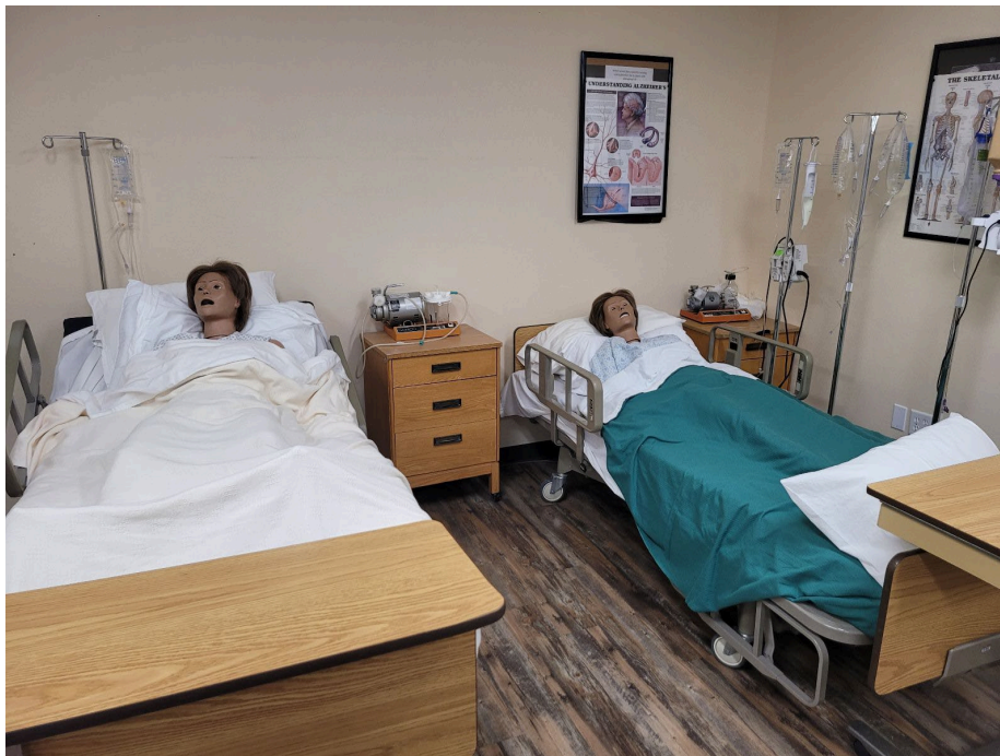
Skills Lab Patient Units