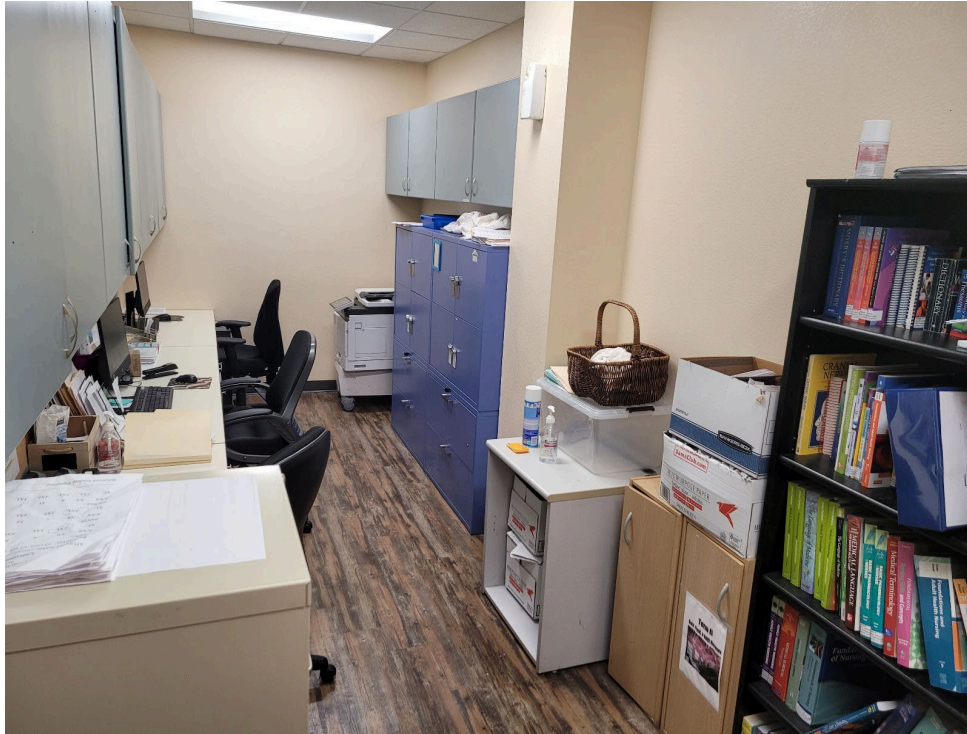
Teacher Resource Room and Office