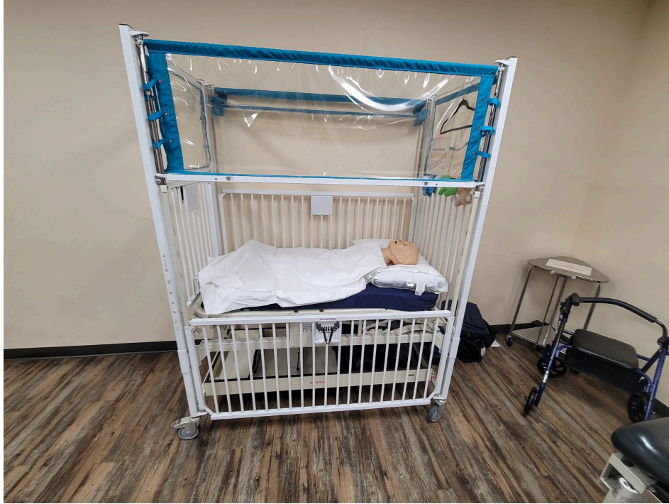
Pediatric Manikin in crib