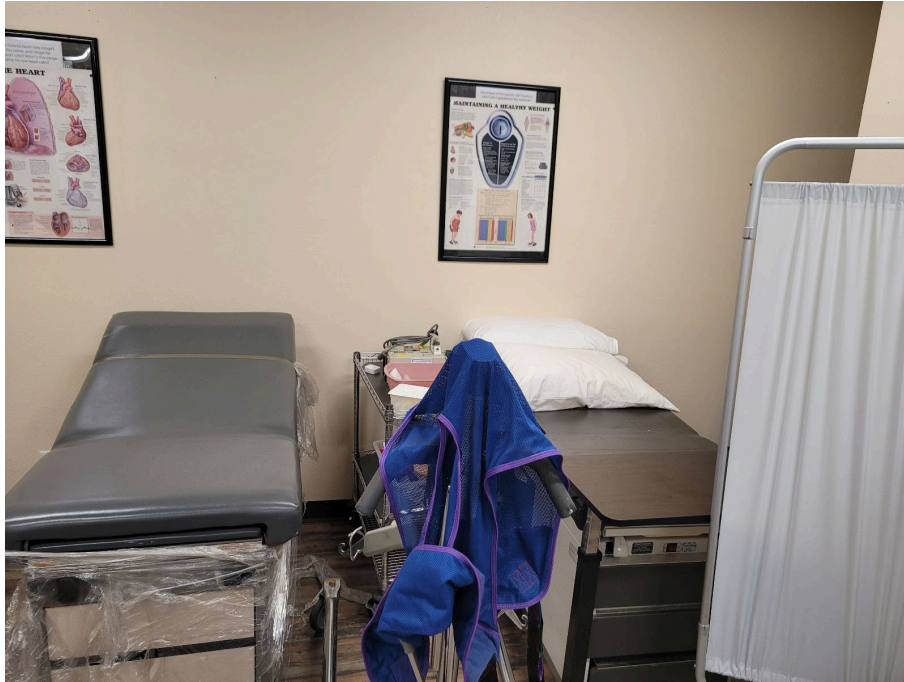
Exam Tables in Skills lab