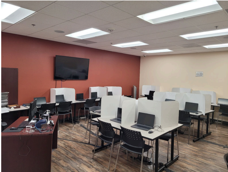
Computer Lab 1