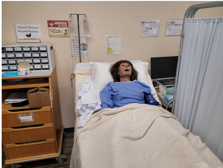
Noelle Birthing Simulator