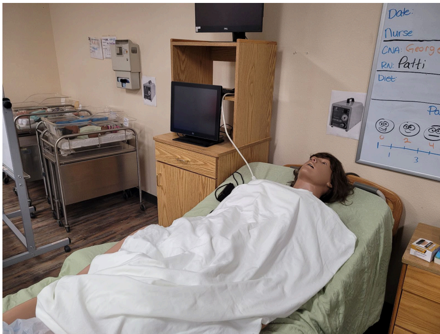
Sims Lab Adult Manikin