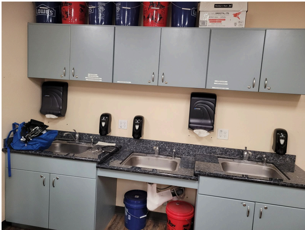
Skills Lab Sinks and Storage