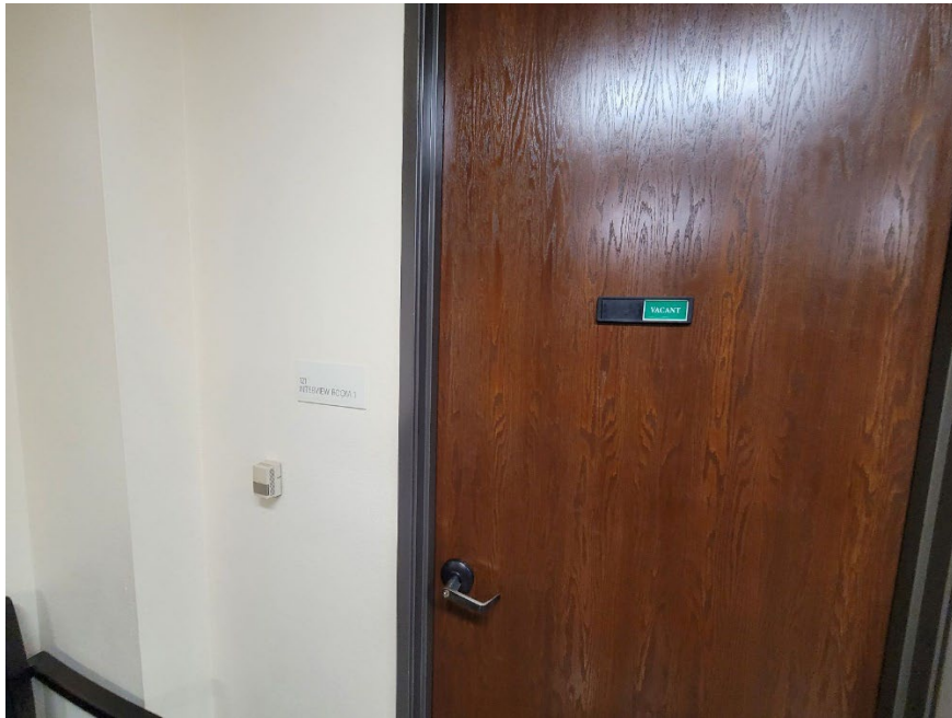
Interview Room 1