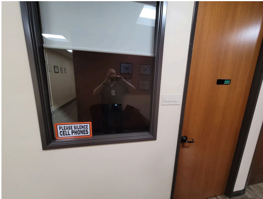
Interview Room 2