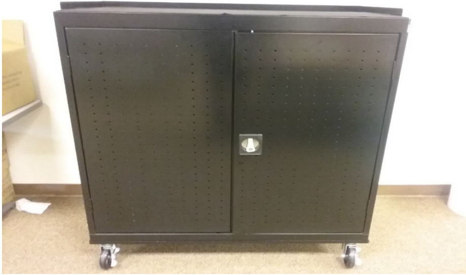
Mobile Student laptop cabinet