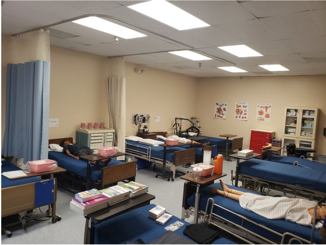
Skills lab with beds and manikins