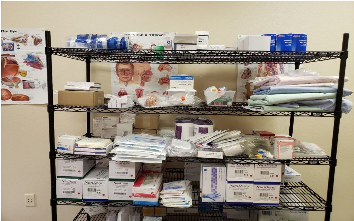
Mobile student supplies cart