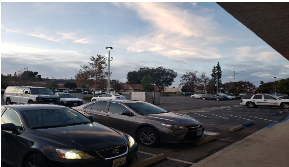
Parking at 876 Jackman.