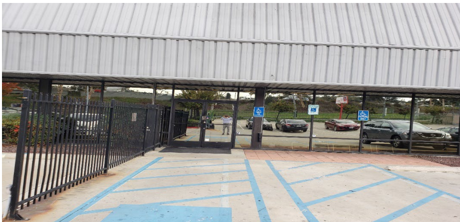
Front entrance to main Summit College El Cajon