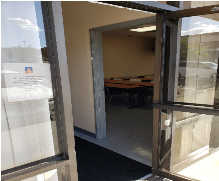
Front Entrance into the lecture classroom.