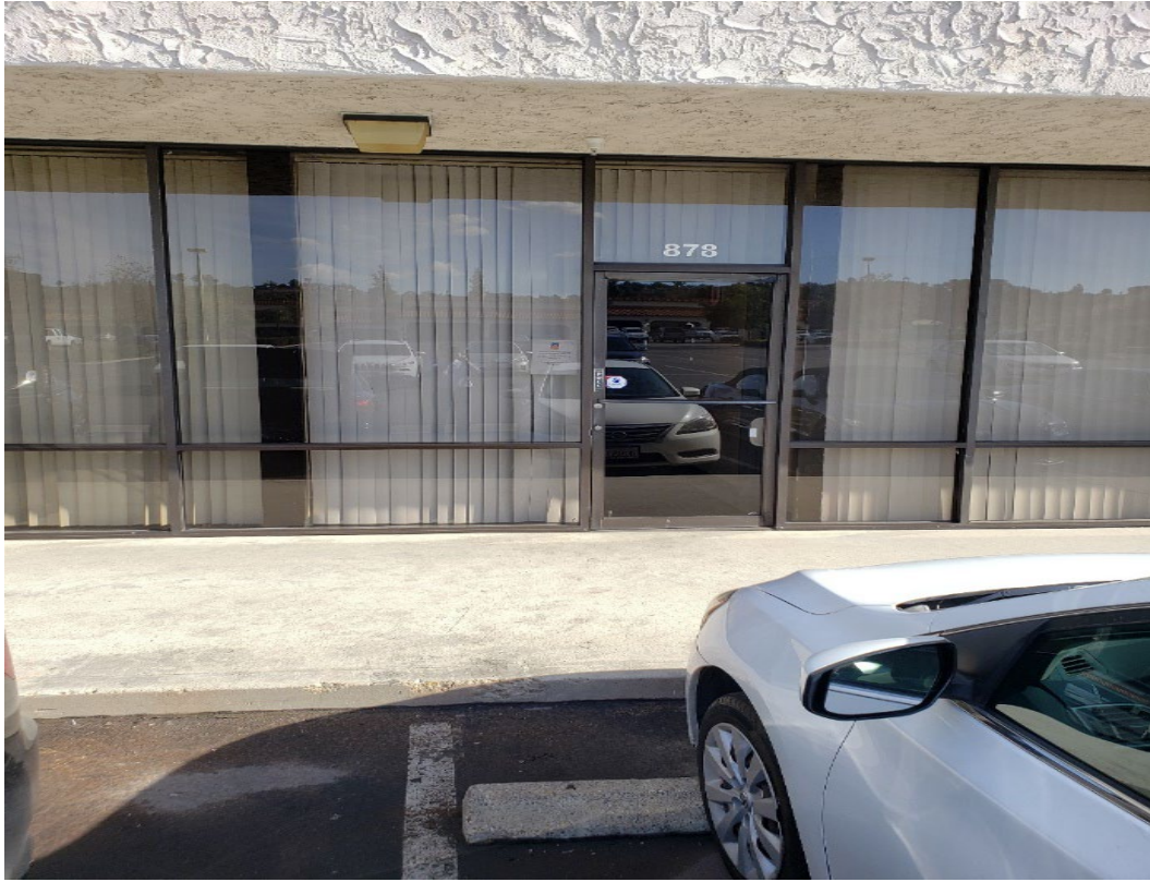
Front door for the vocational nursing program at 876 Jackman St.