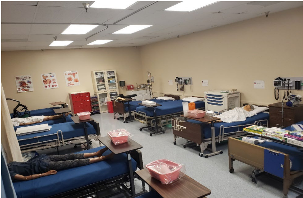
Skills Lab with beds and manikins