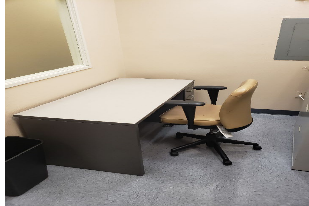
Program Directors Office