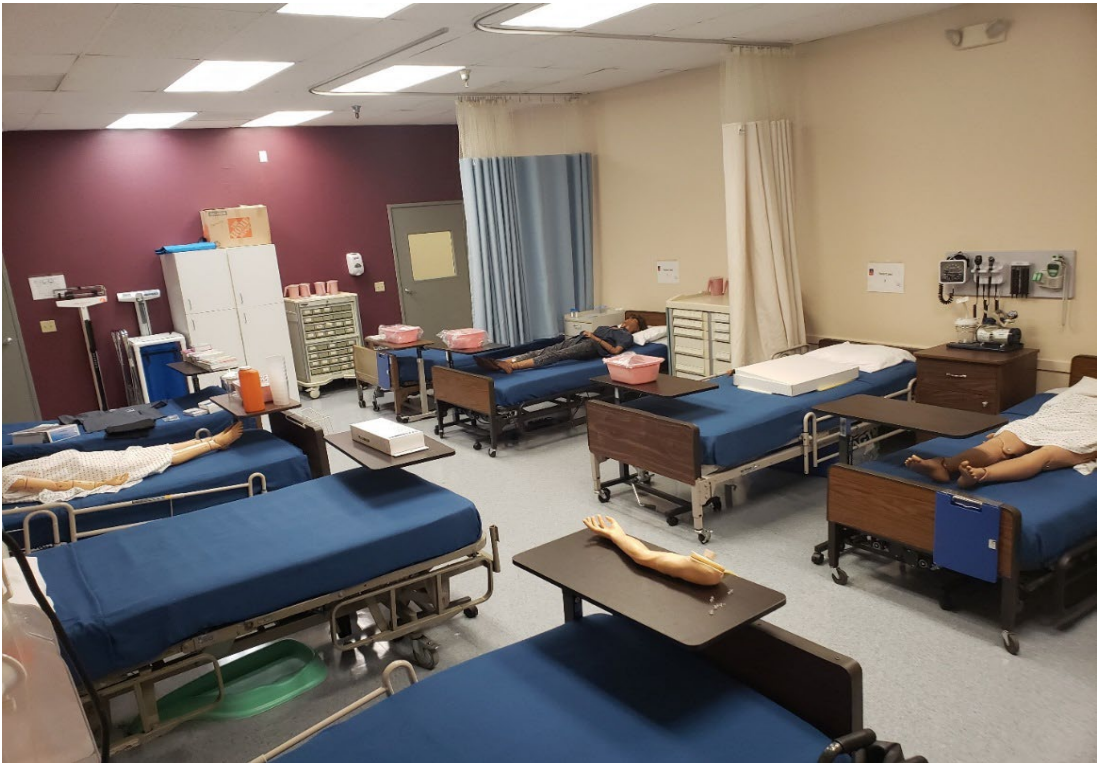
Skills lab from the back of the room