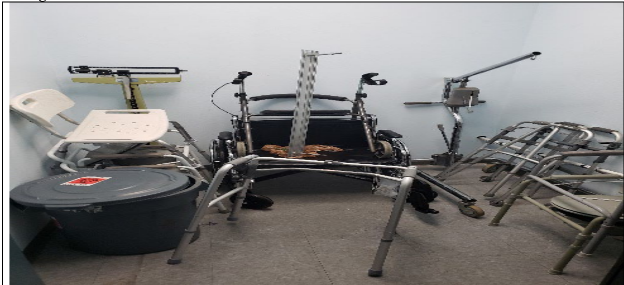
Equipment Storage room