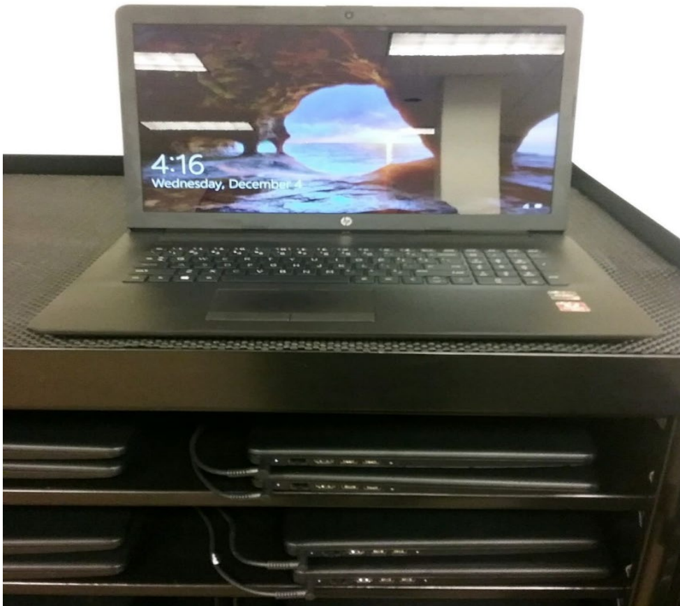
Student laptop storage and charger