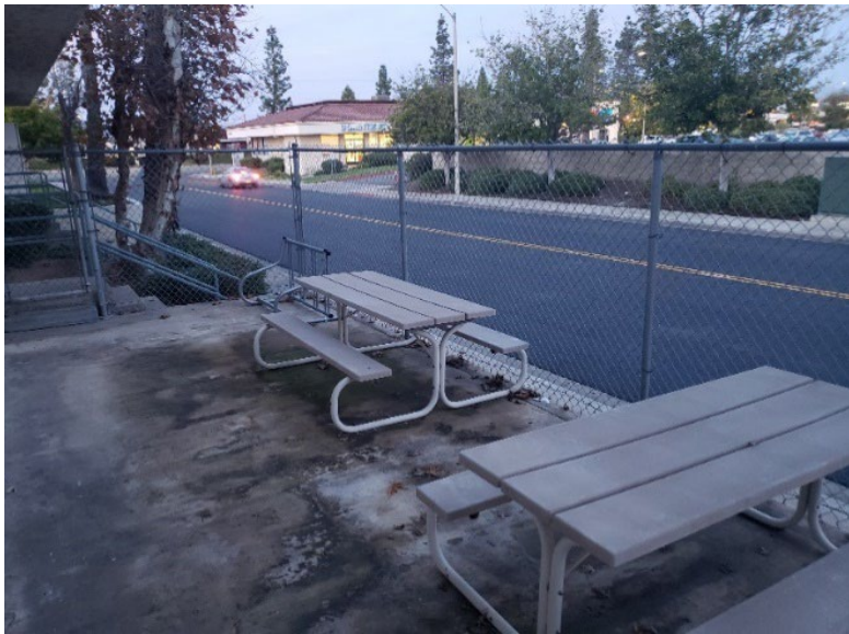
Outside Student Break Area