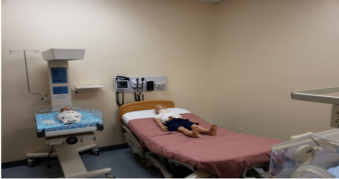
Maternity and /Pediatric skills lab