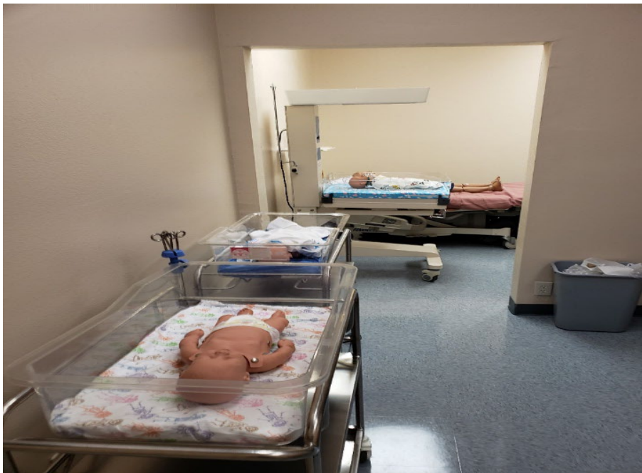
Maternity and Pediatric skills lab