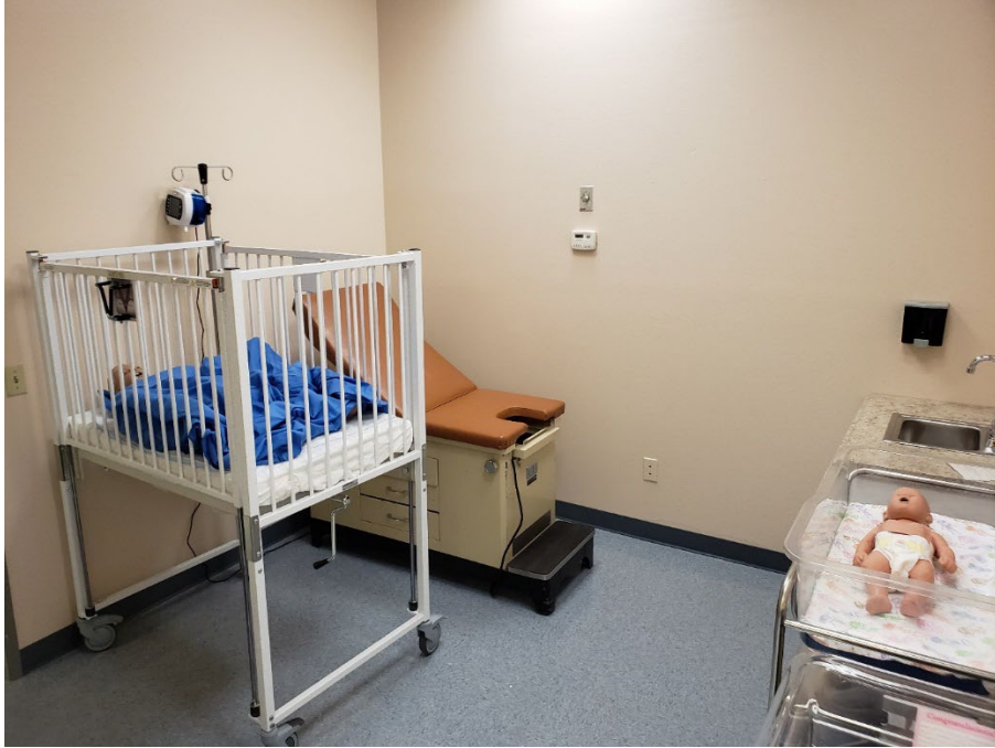
Maternity and Pediatric skills lab