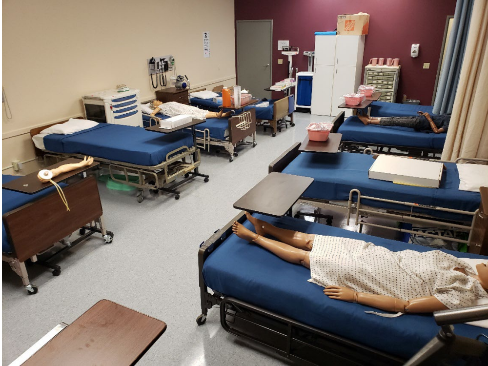
Nursing Skills Lab from back of lab