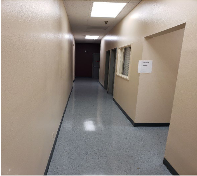
Hallway to OB/Peds skills lab and break room