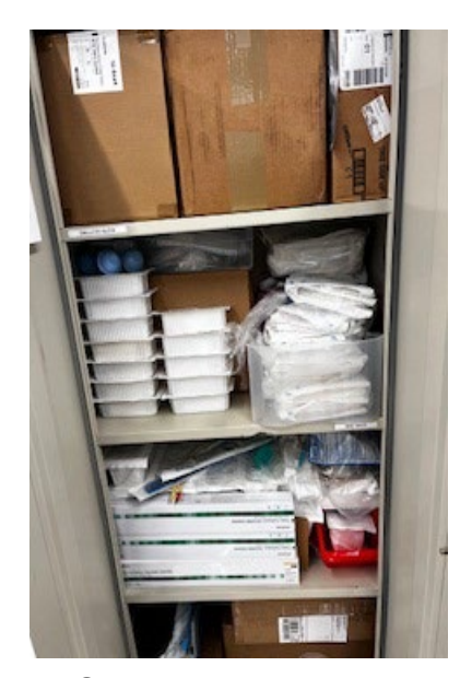
Skills lab supplies