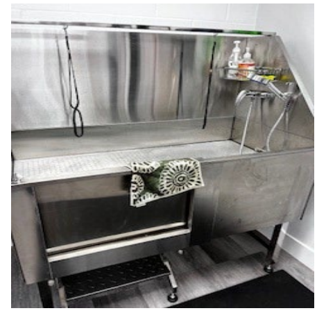
Pet washing area in the next room