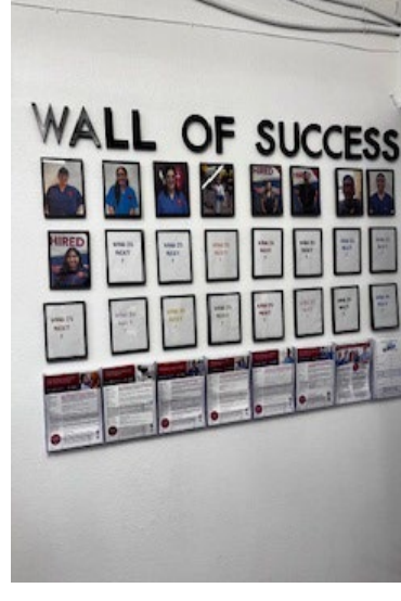
Reception desk area