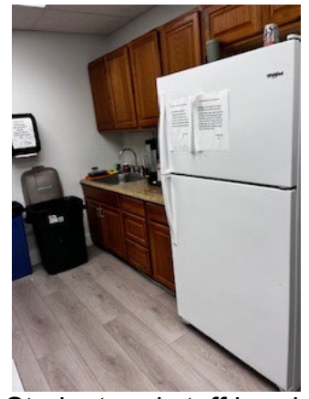
Student and staff break room