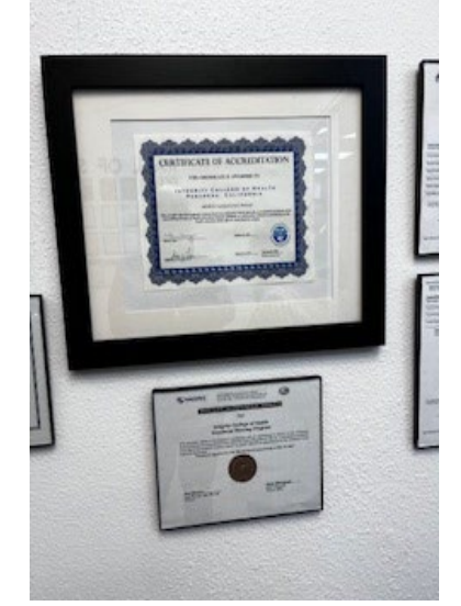
Front entrance reception desk