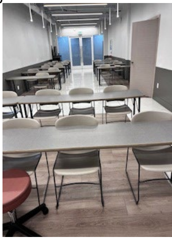
VN classroom (different view)