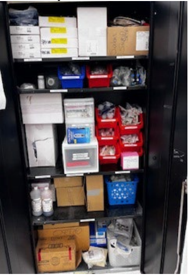
Skill lab supplies