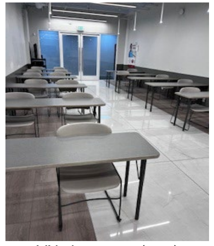
VN classroom (rear)