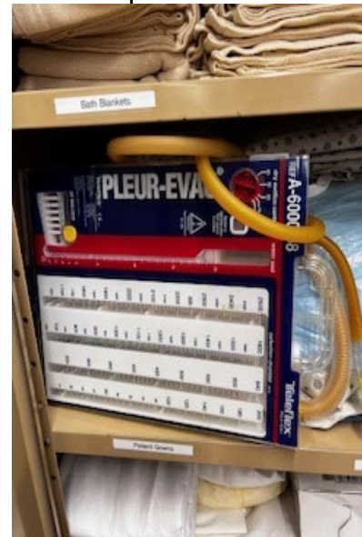
Skills lab supplies