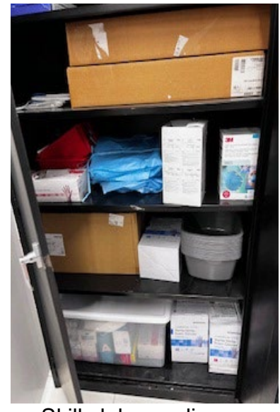
Skills lab supplies