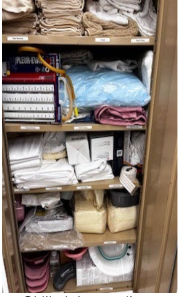
Skills lab supplies