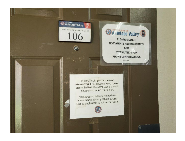
Student Learning Resource Center