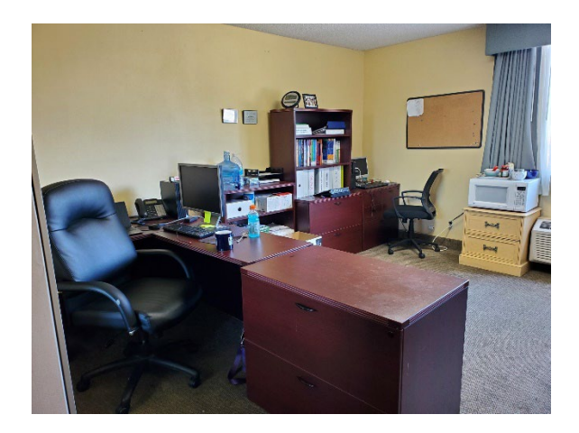
Program Director's Office