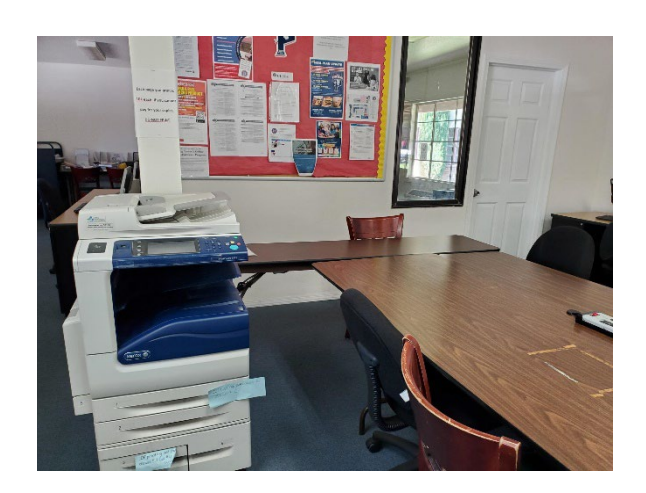
Copier in Student Learning Resource Center