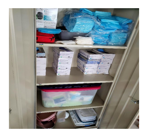
Skills lab supplies