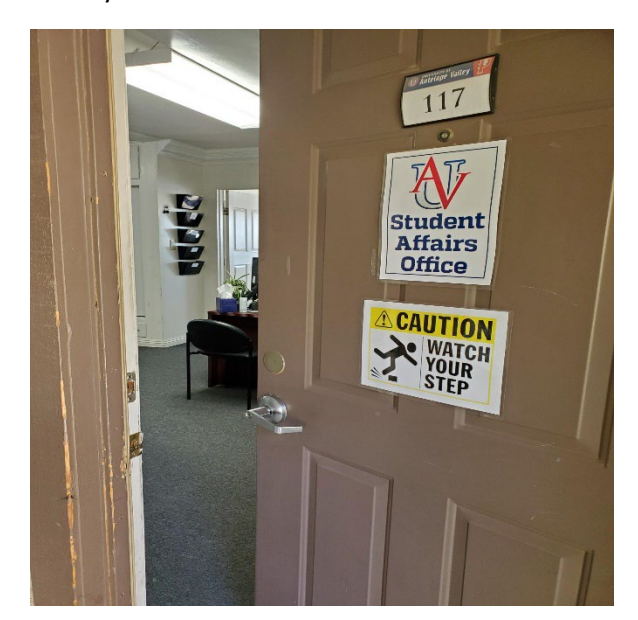
Student Affairs Office