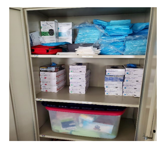
Skills lab supplies