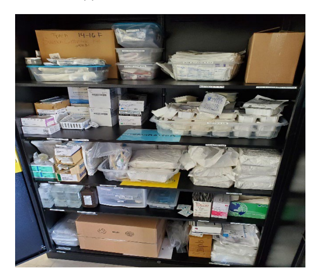
Skills lab supplies