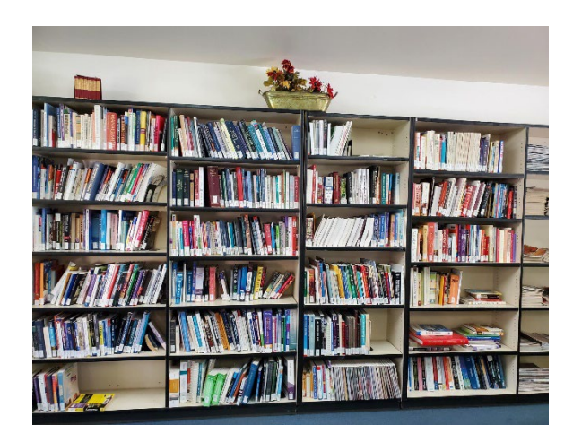
Reference books in Student Learning Resource Center