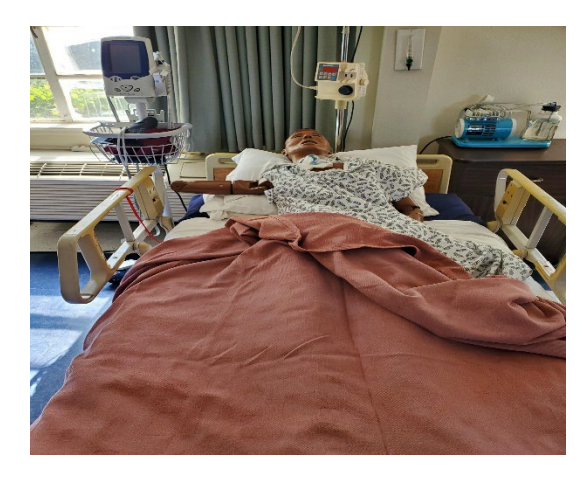
Manikin # 1