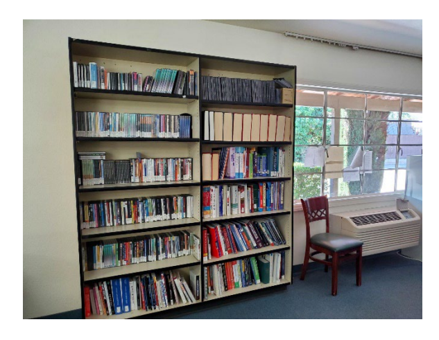
Reference books in Student Learning Resource Center