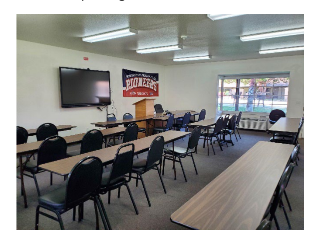
Student Classroom 1