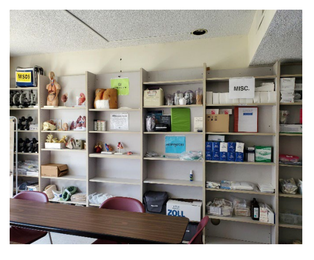
Skills lab supplies