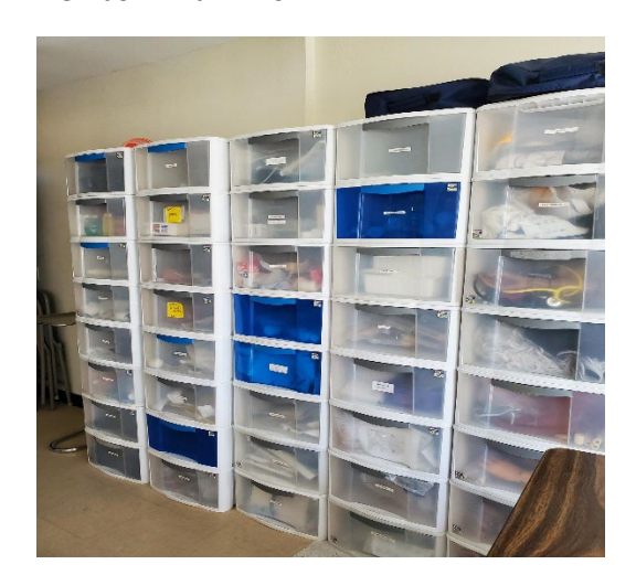
Skills lab supplies