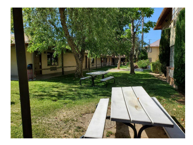
Student break area