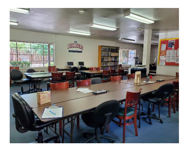
Study area in Student Learning Resource Center