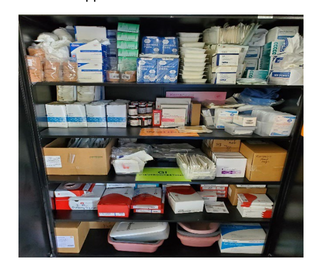
Skills lab supplies