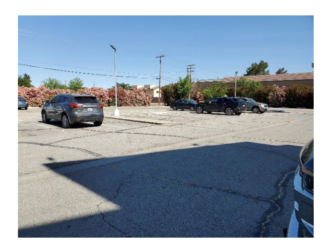
Additional parking area