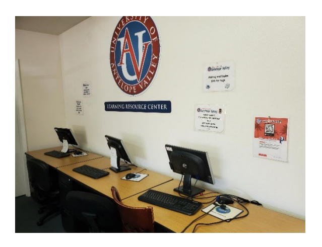
Student Learning Resource Center