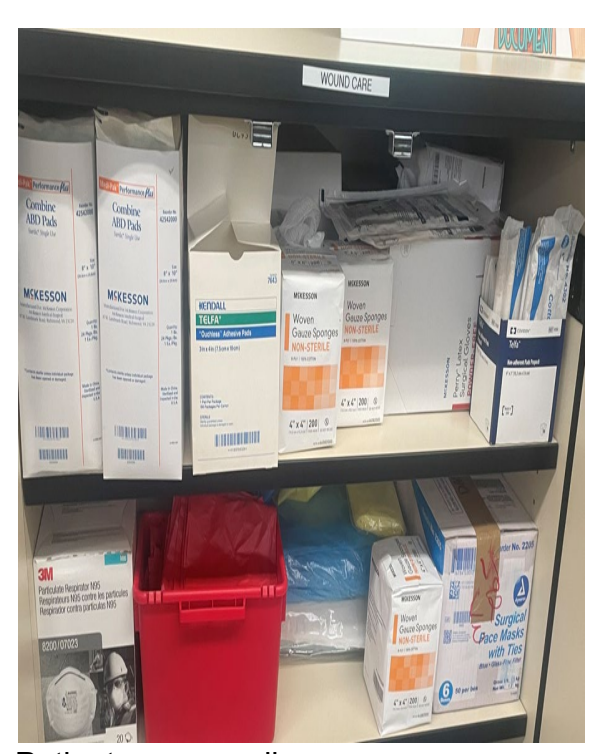
Patient care supplies