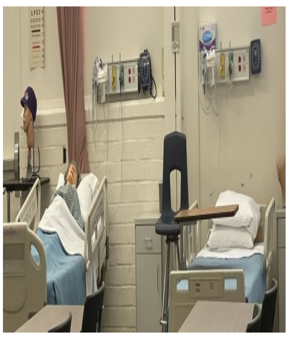
Skills lab with two patient beds, mannequin in one bed