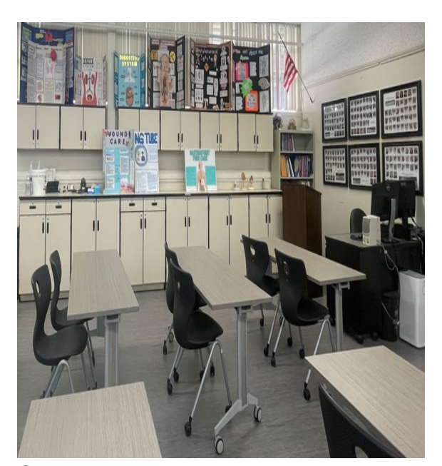
Classroom with desks, chairs, and cabinets