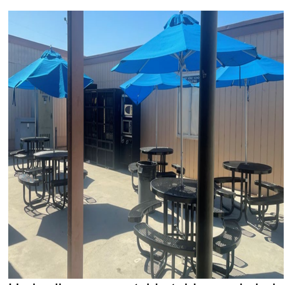
Umbrellas over outside tables and chairs