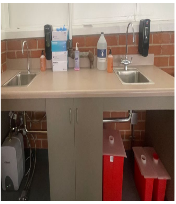
Two sinks in the skills lab