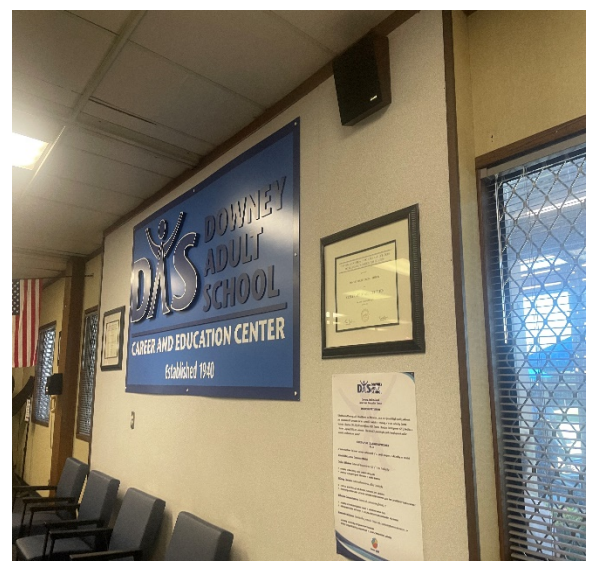
Downey Adult School sign and pictures on the wall