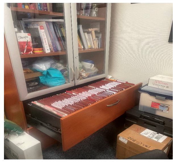
Cabinet with student files pulled out