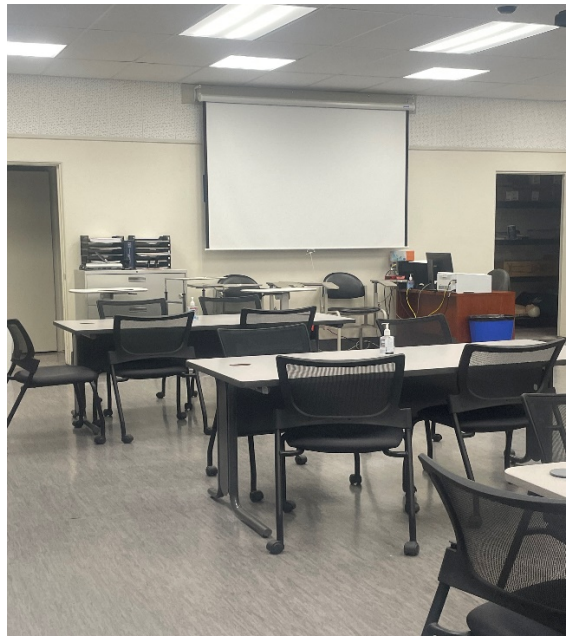
Classroom with desks, chairs, and projection screen on wall