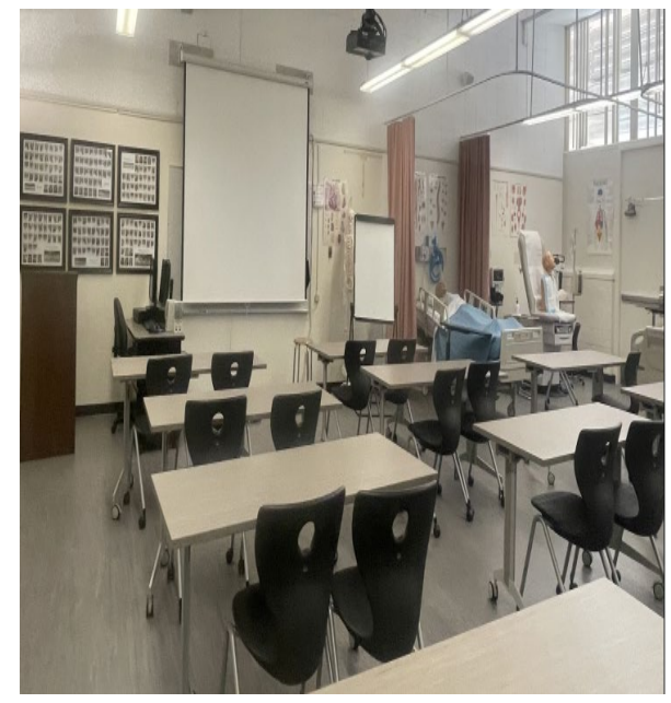
Classroom with desks, chairs, podium, and projection screen on wall