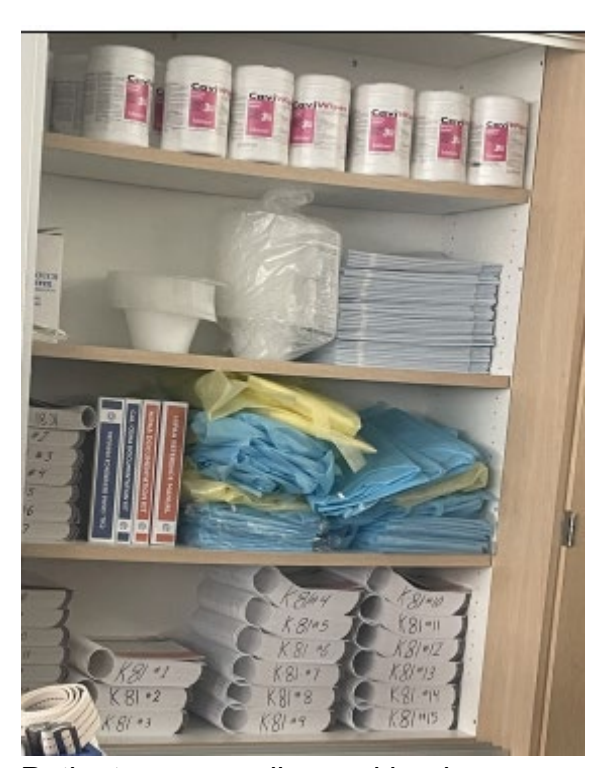
Patient care supplies and books