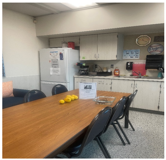
Faculty lounge with long table five chairs, cabinets, and refrigerator