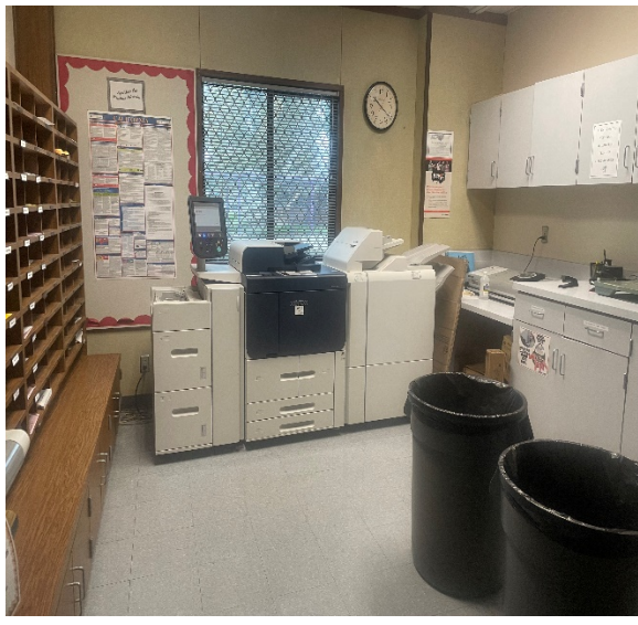
Faculty workroom with printer, cabinets, and shelves