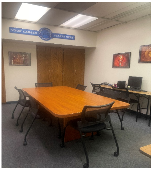
Conference room with long table and six chairs