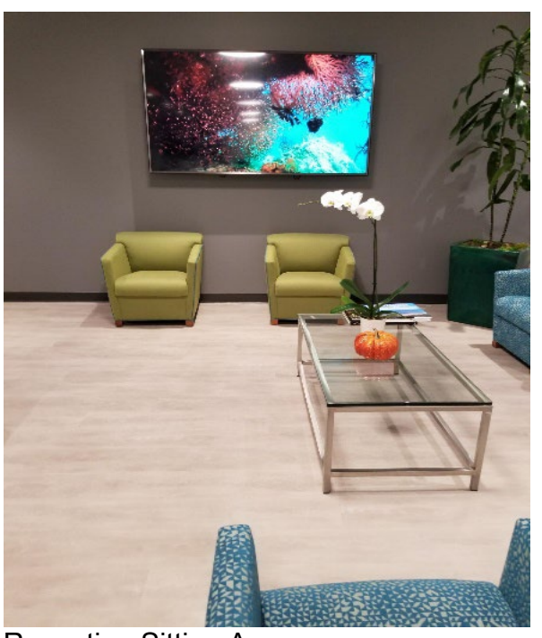
Reception Sitting Area