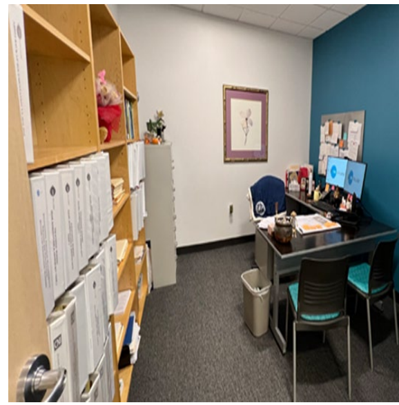
Program Director's Office