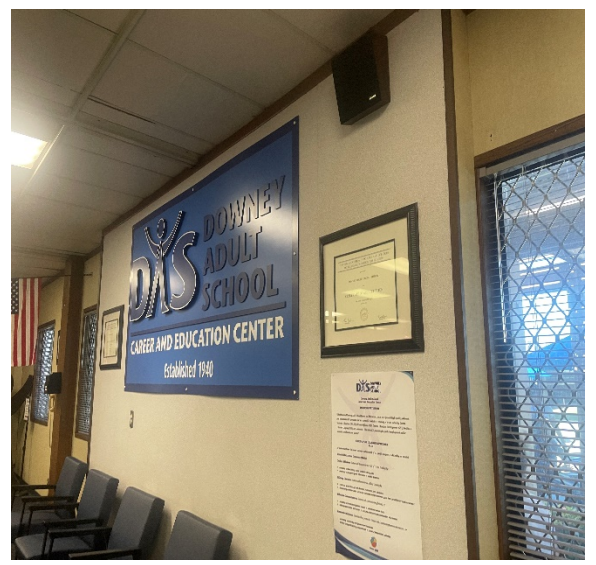
Downey Adult School sign and pictures on the wall