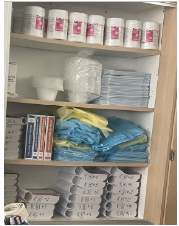
Patient care supplies and books