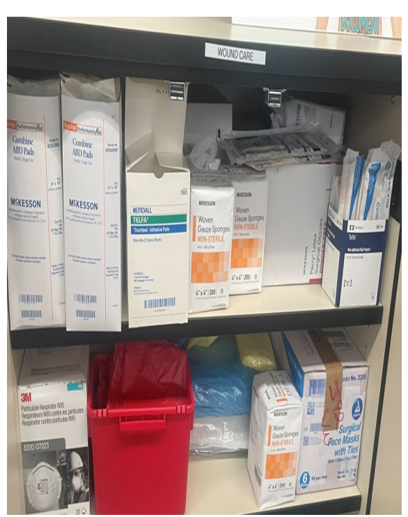
Patient care supplies