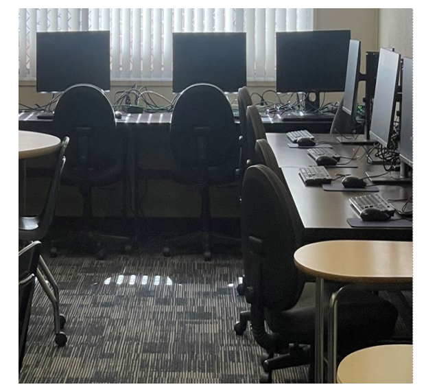
Five computer monitors on desks with chairs