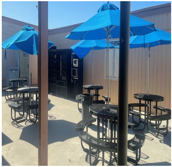
Umbrellas over outside tables and chairs