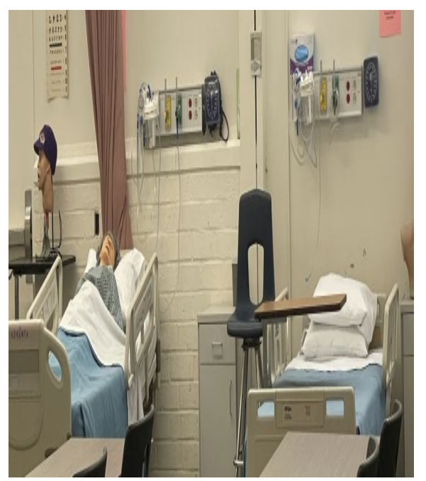
Skills lab with two patient beds, mannequin in one bed