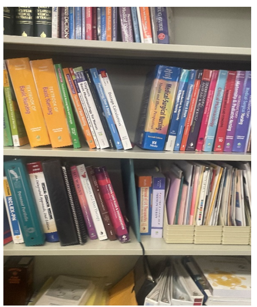
Bookshelf with reference books