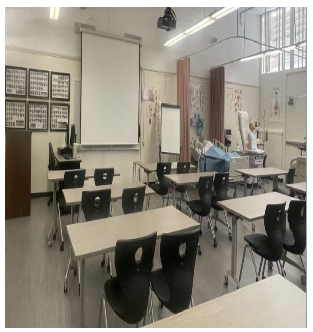
Classroom with desks, chairs, podium, and projection screen on wall