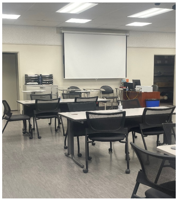
Classroom with desks, chairs, and projection screen on wall