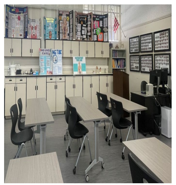
Classroom with desks, chairs, and cabinets