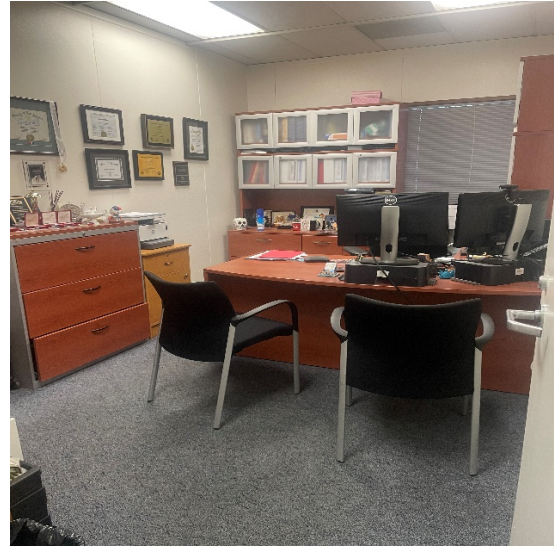
Program Director's office with a desk and chair