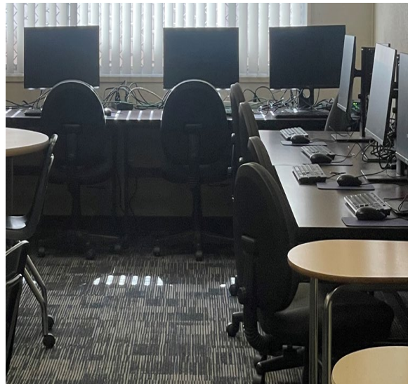
Five computer monitors on desks with chairs