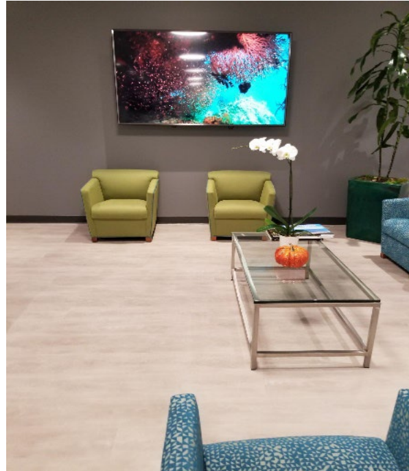
Reception Sitting Area