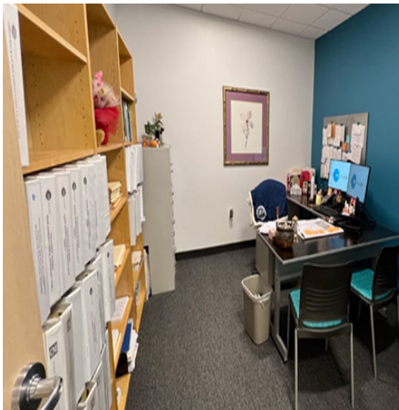
Program Director's Office