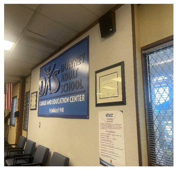
Downey Adult School sign and pictures on the wall