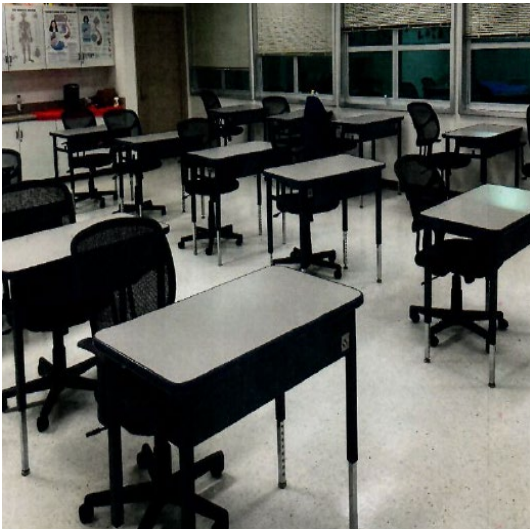
Desks in classroom