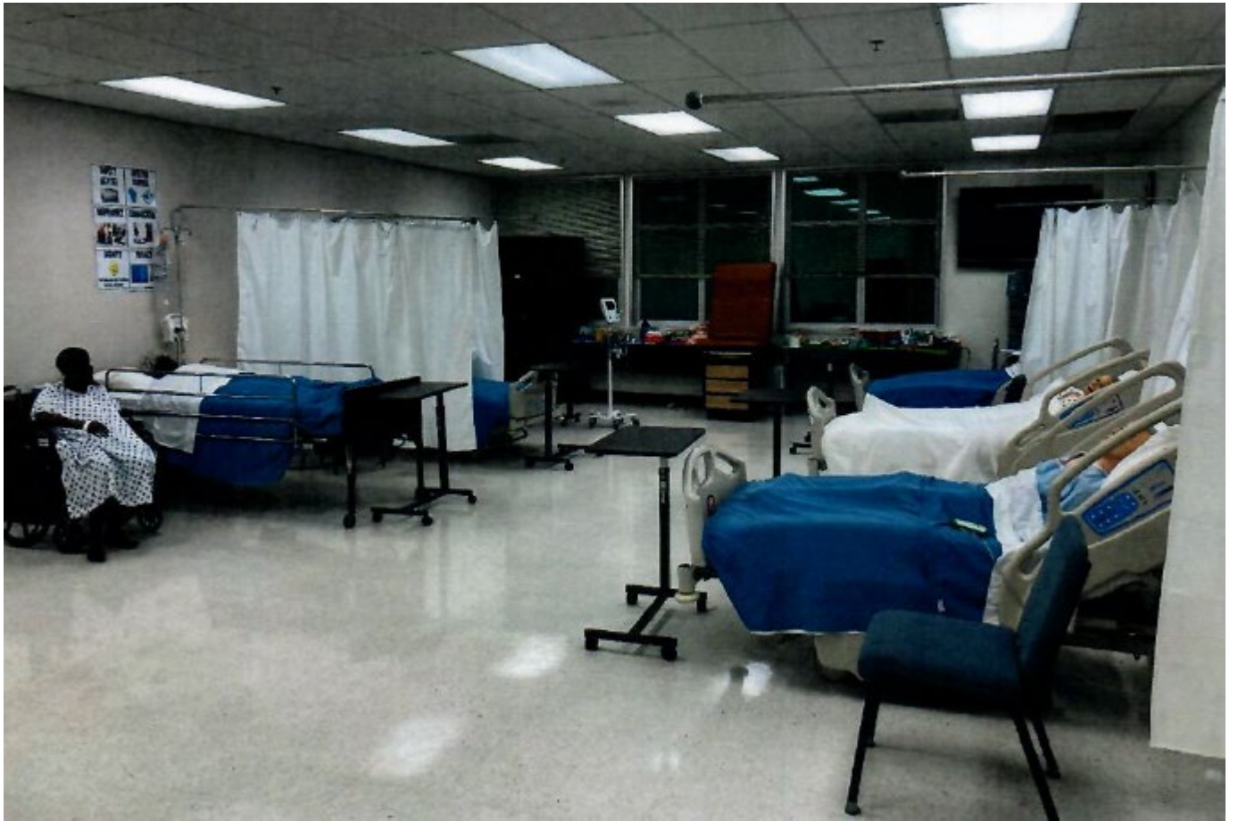
Full view of skills lab