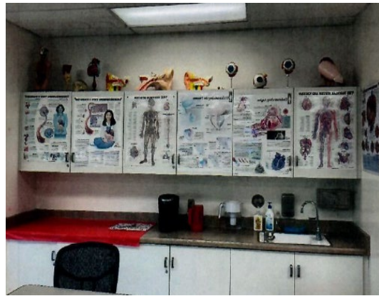
Back of classroom