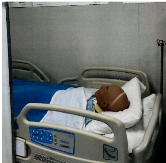
High-fidelity patient simulation